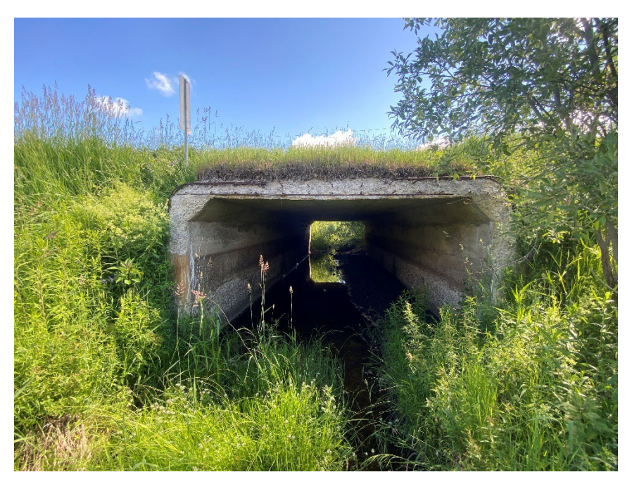
Figure 1 - Elevation View